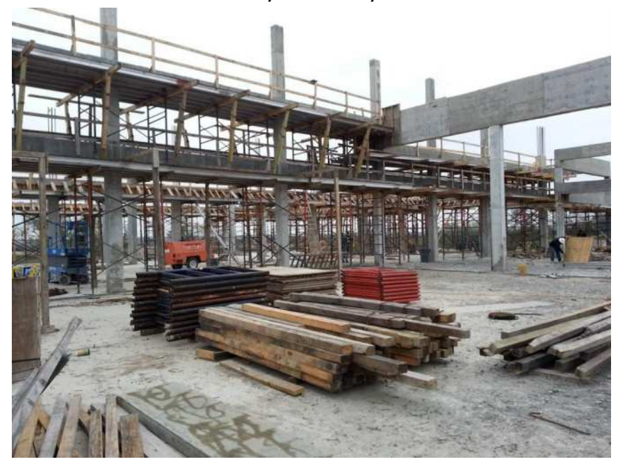
{\bf 37}^{\rm th} week of construction: Things are looking good!

The field office, or "Bishop's Budka," for the Polish Heritage Center should be open sometime in the second week of January. Come by to see and learn about our project!