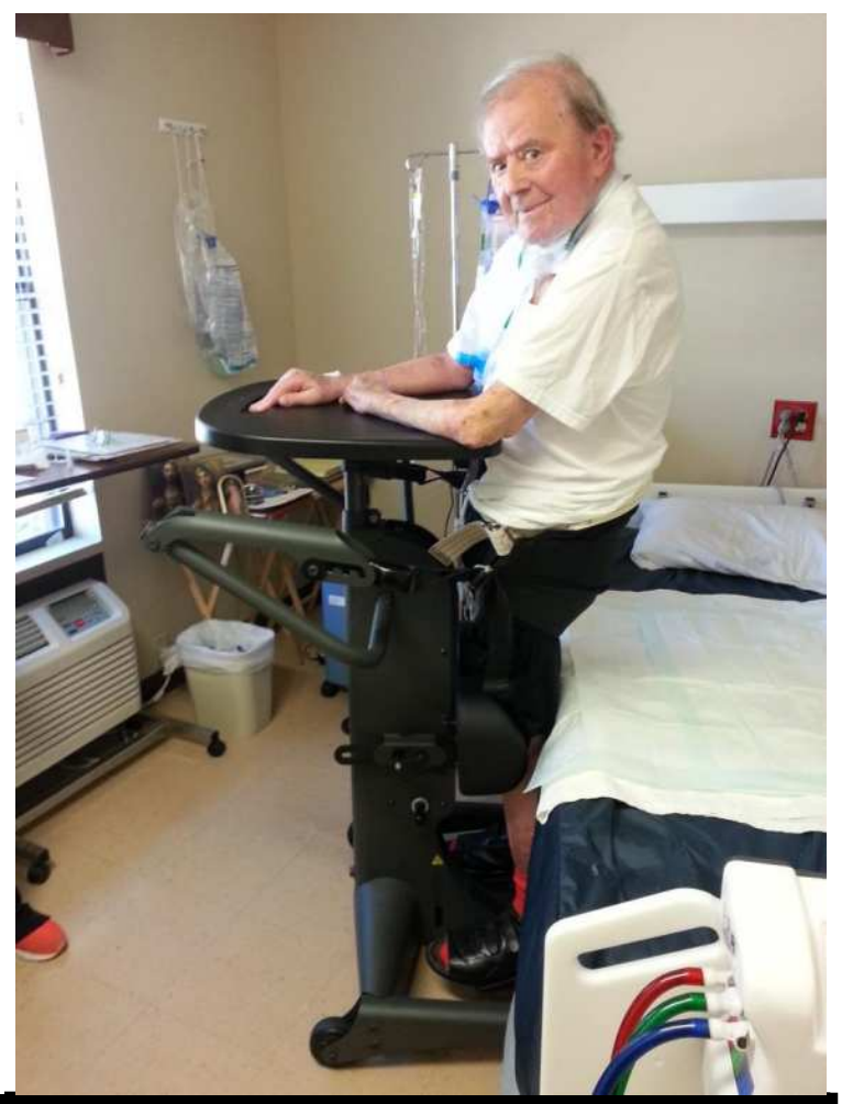
Edition: April 19, 2017

Polish Heritage Center at Panna Maria Foundation P.O. Box 28125, San Antonio, TX 78228 Tax ID: 46-0561240. A 501(c) (3) organization. http://www.polishheritagecenterpannamaria.org/