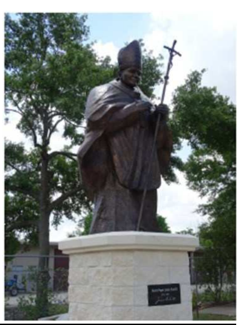
September 6, 2018

The election of the Polish Pope in October 1978 and the creation of "Solidarity" labor movement in 1980 in Poland initiated global political changes. It was the beginning of the end of communism. However, in the early 1980s, the Marshall State in Poland was proclaimed by the communist regime in Poland and the "Solidarity" movement was suppressed. This resulted in the new wave of Polish emigrants who left their home country to gain political and religious freedom.