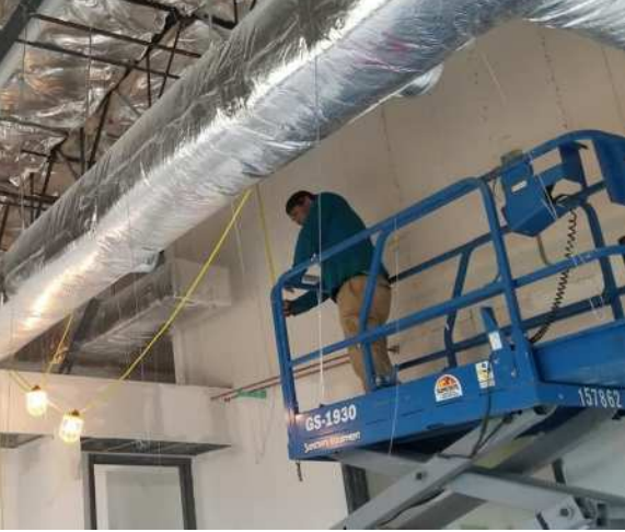
November 16, 2018