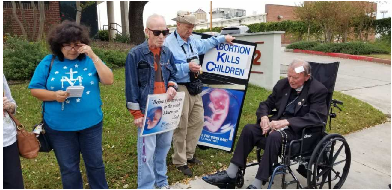
Bishop Yanta participating at a Rosary in front of a Planned Parenthood abortion clinic on October 30, 2018