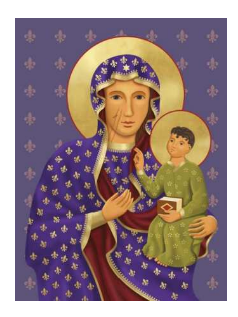
Our Lady of Czestochowa

In the rotunda, surrounding Cyril and Methodius are four niches; each niche contains the portrait of a different saint revered in the Silesian Polish culture. A narration will explain the significance of the four saints: 1) Our Lady of Czestochowa, spiritual heart of Poland and its people, 2) St. Stanislaus (1030-1078), Bishop of Krakow and Martyr, Patron Saint of Poland, 3) St. Hedwig (1174-1243), mother of seven children, widowed, then became a Cistercian nun, founder of hospitals and Patroness of Silesia, and 4) St. Hyacinth (1185-1257) Apostle of Poland, native of our ancestral Silesian area in Poland.