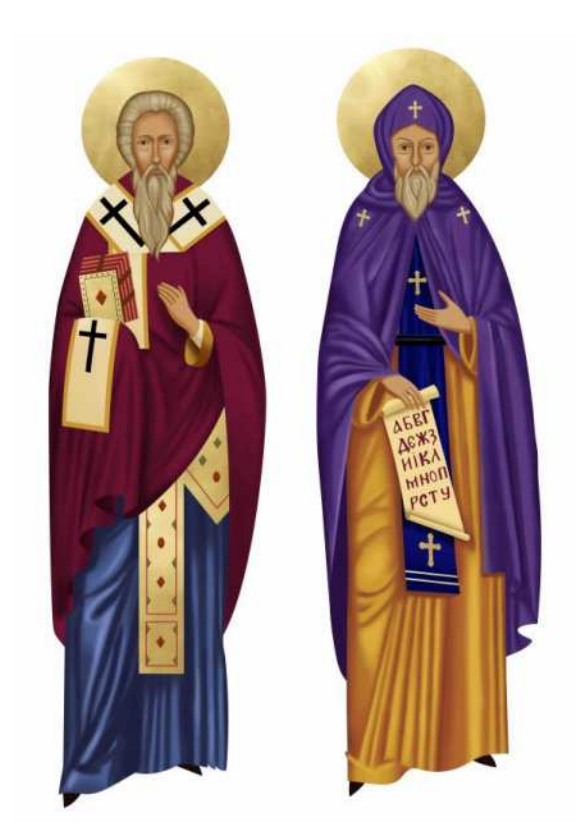
Figure 1: Saints Cyril and Methodius

The visitor will first hear a narrator explaining that the rotunda represents the SPIRITUAL HUB of the Center. As they enter the rotunda, on the circular ledge above, they will view the great and last command of Jesus Christ "Go Make Disciples of All Nations" displayed in colorful text in English, Polish and Spanish. Icons – the dove or Holy Spirit, the keys to the Kingdom of Heaven, and the Christian symbol of fish and anchor – separate the statement in each language.