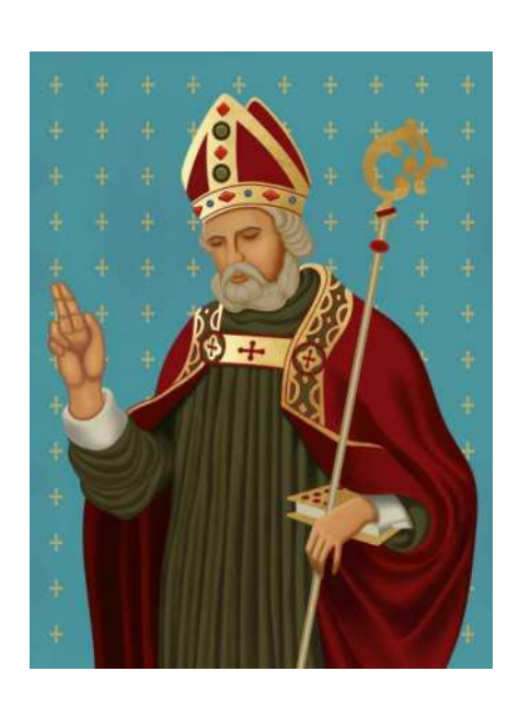
St. Stanislaus, Patron Saint of Poland