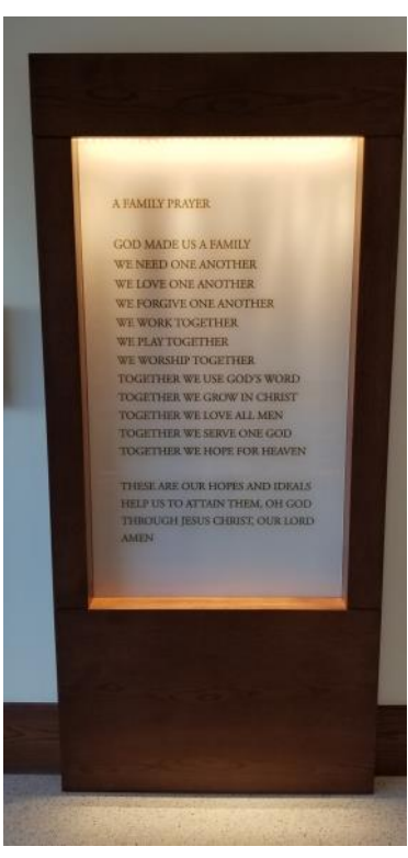
The "Family Prayer" panel that is located in the Lobby

A few of the many photographic images of our families and communities in the Heritage Center