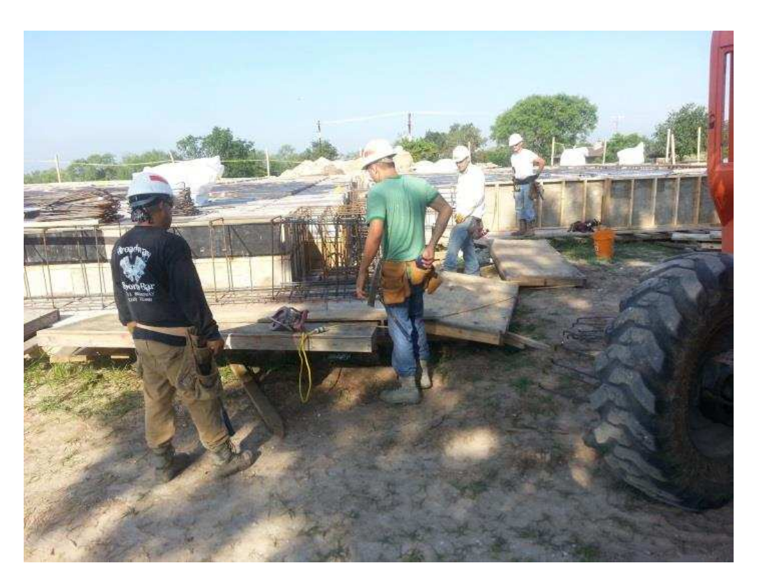
Week 9 highlights – building the forms!