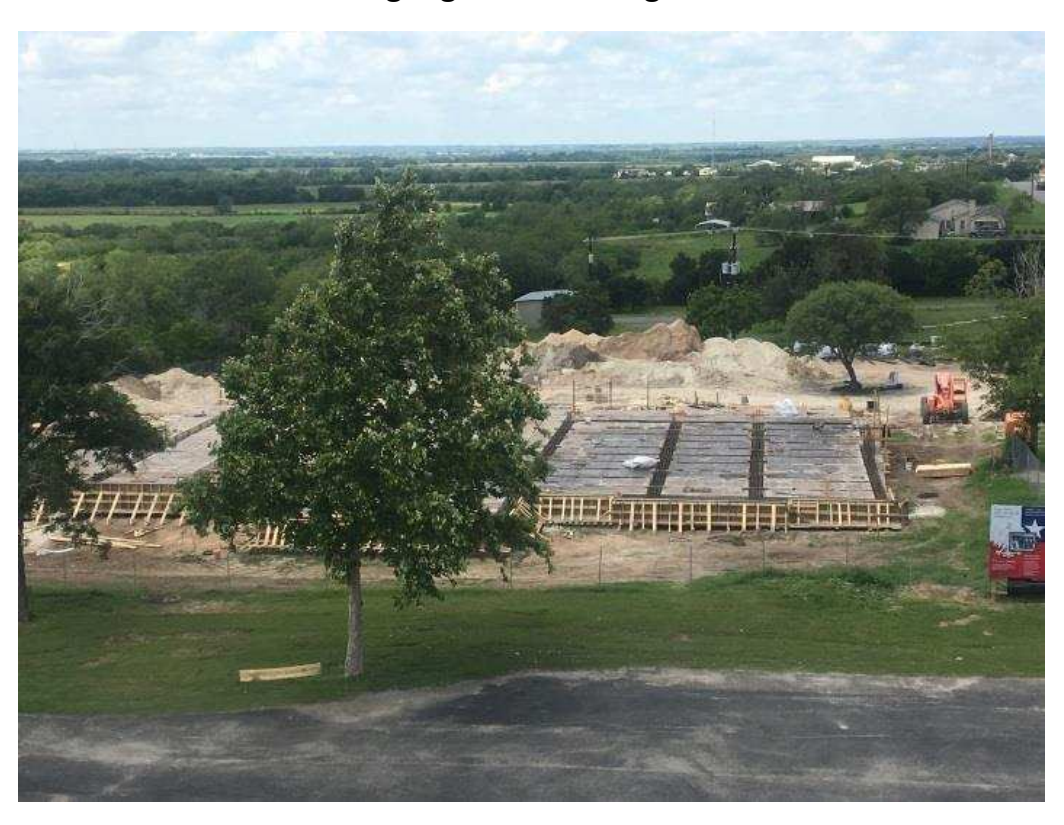
Week 9, a bird's eye view from a cherry picker!