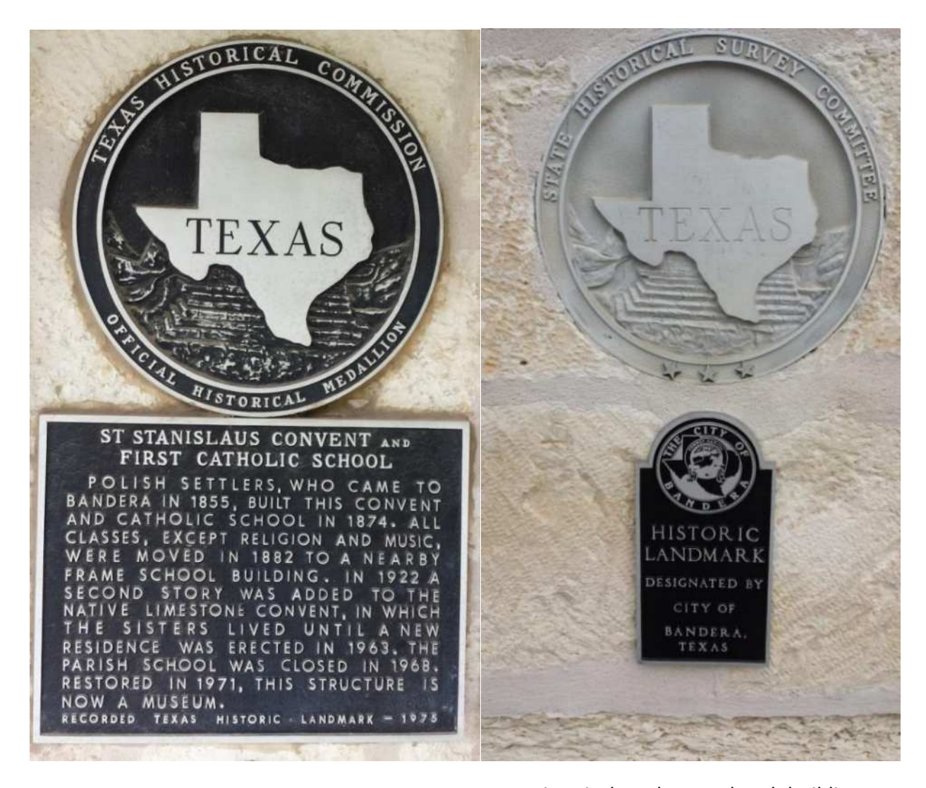
Historical marker on the old convent building