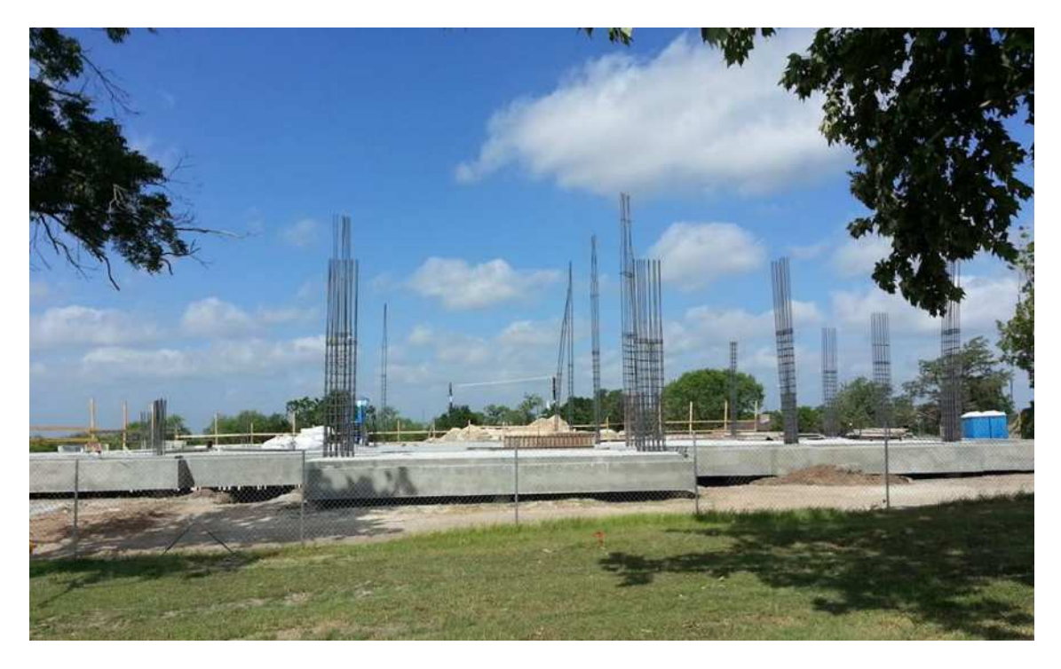
Week 13, beginning of pilings to roof

The 3<sup>rd</sup> month's construction bill was $217,854.96. It was paid from our checking account which is getting low. We have avoided using our interim financing from the bank in order to avoid paying interest. Next month's bill is probably going to be twice or three times greater. Please pray for our Polish Heritage Center which will be here for many generations and for many years, like our beautiful churches. It will become a source of great spiritual growth and strength for our families and make us proud of where we came from, as well as how we got here, and how our ancestors suffered and sacrificed for us!