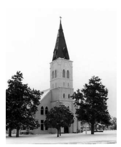
Present church in the snow of 1985

After 1880, a new wave of immigrants from other parts of Poland came to St. Hedwig. Many first arrived on the east coast of the United States and then traveled to Texas. By 1900, the church built of native sandstone could no longer