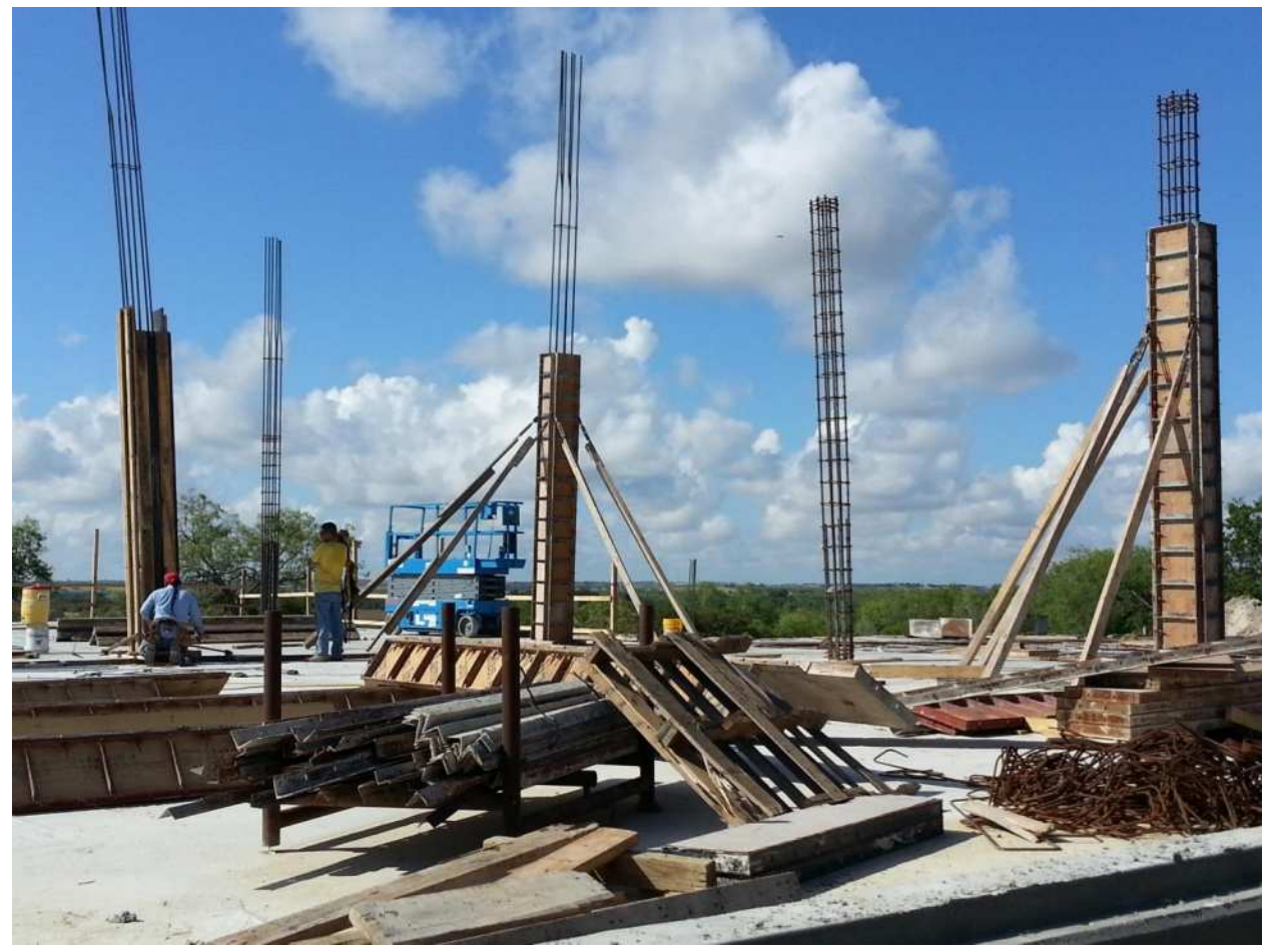
Week 13, columns being formed!