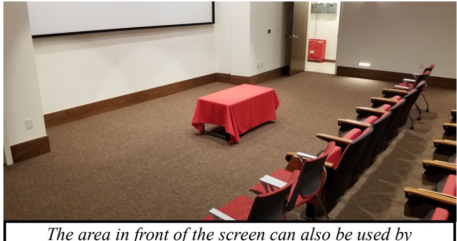
The area in front of the screen can also be used by presenters, programs, and displays.

The theater system (power. volume. source selection, starting / stopping of presentations, lighting presets) is controlled from a 7" touch panel mounted the in equipment rack. The control system allows presets to offer simple configuration of the system for theater use or for multi-purpose presentations."