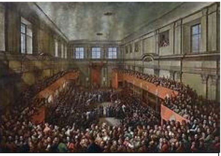
Photo Credit To Wikipedia Commons / In 1791 the "Great" (Four-Year) Sejm (1788–92) and Senate adopted the Constitution at Warsaw's Royal Castle history.info/on-this-day/1791-the-first-modern-constitution-ineurope-got-poland-not-france/

"The Holy Roman-Catholic Faith, with all its privileges and immunities, shall be the dominant religion. ...but as the same holy religion commands us to love our neighbors, we therefore owe to all people of whatever persuasion, peace in matters of faith, and the protection of government,...freedom and liberty, according to the laws of the country..."