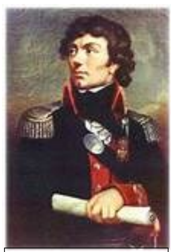
Tadeusz Kościuszko Painting from: polishworld.com/polemb/const/

all its classes full protection of the law: nobility remained dominant, towns people were given full citizenship and the right of political participation, the peasants were granted full protection of the law, and the king was denied all legislative power. The tragedy of the Polish May 3 Constitution was that it did not have the time needed for these farsighted reforms to take root. The three surrounding monarchies (Russia, Prussia, and Austria), felt threatened by these "subversive" democratic ideas and attacked and eventually conquered Poland. The ultimate triumph is that, with the exception of England's Magna Carta of 1215, Poland's constitutionalism can claim to be the oldest in Europe and that its principles have in the end prevailed. Those in the West who say that Poland is a young and inexperienced