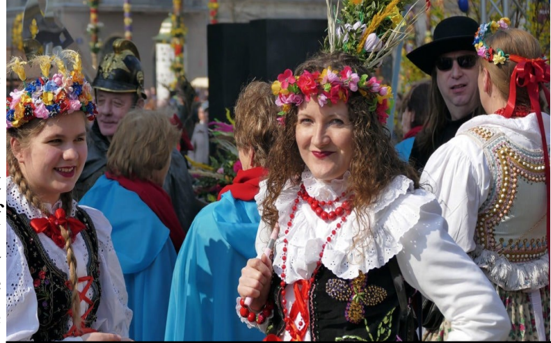
Both articles and the above photograph from: https://www.trafalgar.com/real-word/7 unique-polish-traditions

Monday. The whole country follows an age-old tradition which resembles one big water fight. This is one of the Polish traditions linked to Christianiwhereby splashing water is considered a blessing. Moreover, Wet Monday celebrates the arrival of and spring the future relationship. The Poles believe the girl who gets the most soaked in the celebration will be the first to marry.