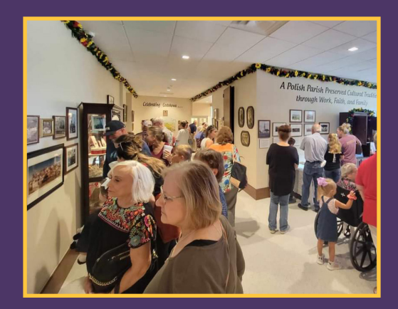
Cestohowa community members view photos and artifacts spanning 150 years.