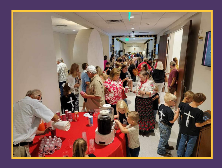
Cestohowa exhibit grand opening